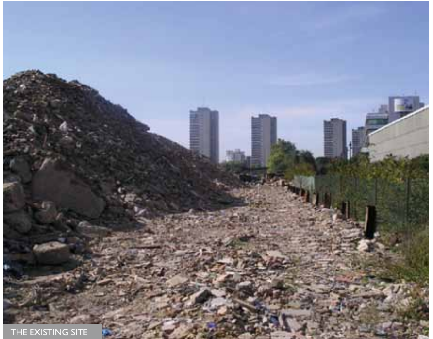
THE EXISTING SITE

Director, Lionel Road Developments Limited